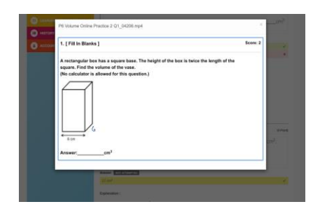
Exam Result and Feedback